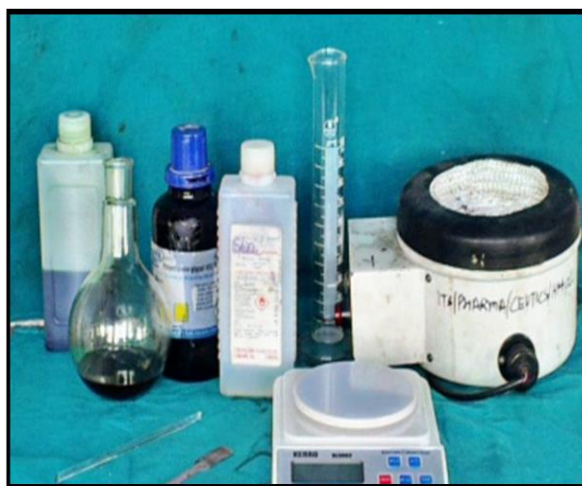
Fig. 1: Armamentarium for preparation of 4% Ocimum sanctum extract

Patients were evaluated after 30 days interval. Periodontal assessments were performed using the Plaque Index using (Turesky Gilmore Glickman modification of Quigley Hein Plaque Index, 1970) 19 , Gingival Index (Loe & Silness, 1963) 20 , Probing Depth and Clinical Attachment Level were measured using UNC 15 probe.