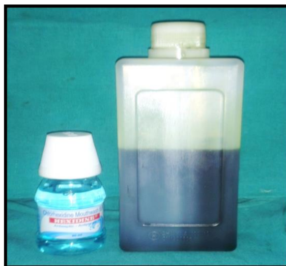
Fig. 2: 0.2% Chlorhexidine gluconate and 4% Ocimum sanctum extract