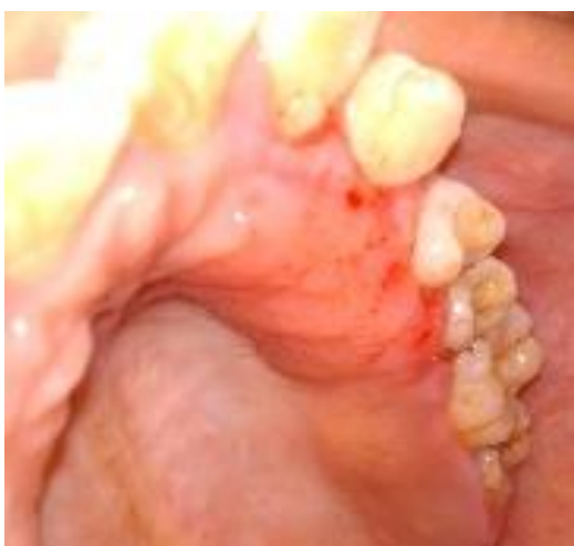
Fig.6: Post operative view palatal aspect of left maxillary gingiva after gingivectomy (after 1 week)