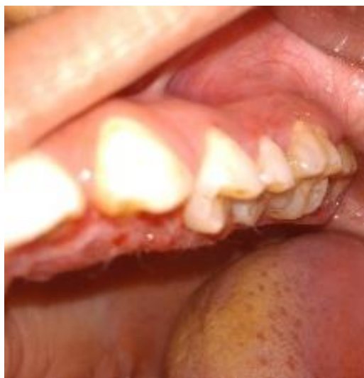
Fig. 5: Post operative view buccal aspect of left maxillary gingiva

Histopathological examination showed stratified squamous epithelium supported by fibrocellular connective tissue stroma. The stroma was composed of mild inflammatory cells, thick and thin bundles of collagen associated with numerous plump fibroblasts. These finding suggested the diagnosis of fibrous hyperplasia (Fig. 12 & 13).