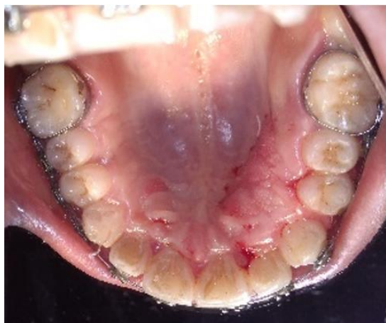
Fig. 10: Post operative view of left maxillary gingiva after 6 months