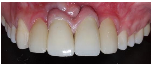
Fig. 12: Intra-oral view of definitive Paulo Malo prosthesis and laminate veneers

The zirconia crowns were cemented with a resin reinforced glass ionomer cement (Fuji Cem, GC) and the laminates with a resin cement (Calibra).