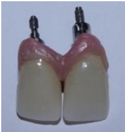
Fig. 11: Definitive prosthesis

Thereafter, the ceramic of the various parts of the definitive prosthesis were glazed. The abutment screws were tightened to a torque of 30N, followed by blockage of the screw-access hole with gutta percha and composite resin.