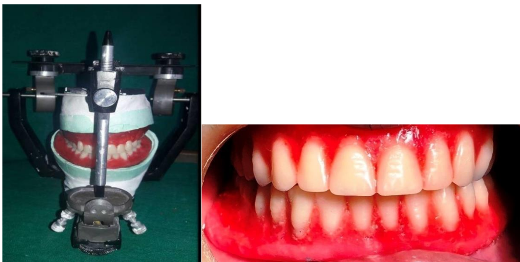
Fig. 7: Try in