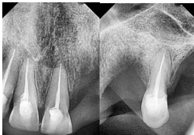
Fig. 3: Post-endo RVG