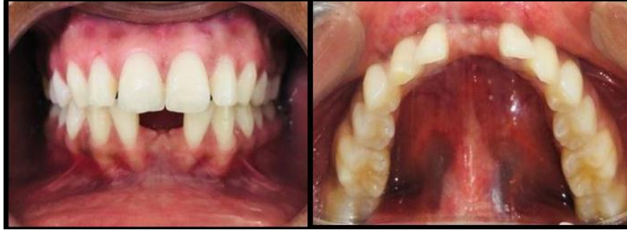
Fig. 1: Preoperative frontal view with a missing mandibular central incisors