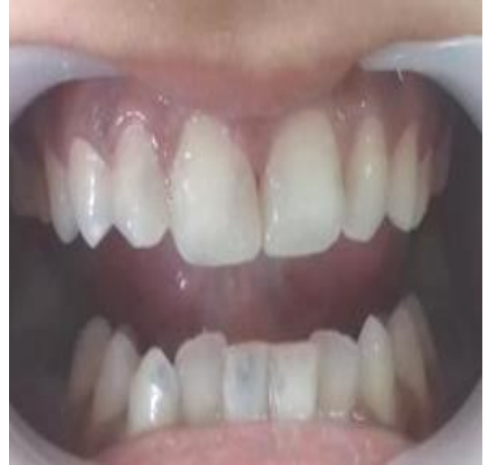
Fig. 7: Post-operative photograph for the case 2