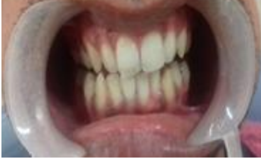
Fig. 4: Temporisation of veneer preparations