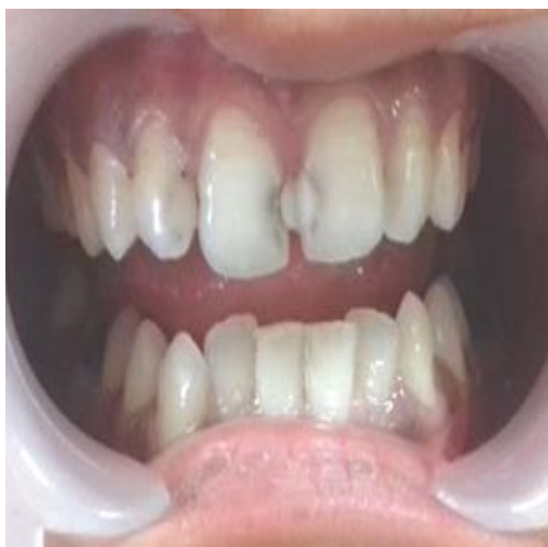
Fig. 6: Pre-operative photograph for the case 2

A 27 year old female patient reported to the department of Conservative Dentistry and Endodontics with the chief complaint of discoloured and dislodged restoration with respect to the upper front teeth. On clinical examination, the upper front teeth showed brown discrete discoloration due to previous restoration (Fig. 6). This case was similar to first case and composite restoration and ceramic veneers were planned. Veneer preparation and cementation was done as discussed earlier (Fig. 7).