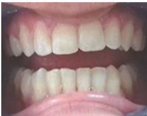
Fig. 9: Post-operative photograph for the case 3 with veneers on 11 and 21