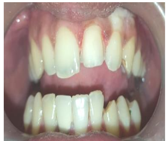
Fig. 2: Intraoral photograph showing Veneer preparation