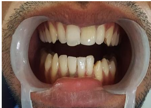
Fig. 5: Post-operative intraoral photograph showing veneer after cementation