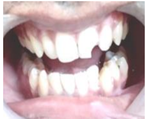
Fig. 1: Pre-operative intraoral photograph of case 1

After removal of excess cement from the buccal and palatal surfaces using an explorer and with the help of a mylar strip or a floss for the interproximal areas, a layer of glycerine was applied on the margins. The restorations were then photopolymerized and the occlusion was checked if any points came on the porcelain-tooth interface. Thereafter, the margins were finished and polished with diamond burs, rubber points and diamond polishing paste (Fig. 5). 7