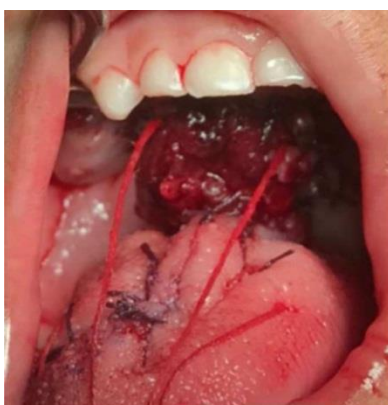
Fig. 3: Posteriorly based tongue flap of adequate breadth is raised, rotated, and carefully sutured on the defect