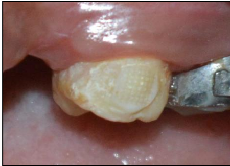
Fig. 2: Photograph of adhesive remaining on the tooth after loss of bracket

The statistical analysis of the data was done with IBM SPSS version 20.0. The descriptive statistics including the means, standard deviation, minimum and maximum values were calculated for each of the experimental groups. Table 1 shows the comparison of the survival rate. 4.4% of breakages were reported in indirect bonding group and 3.3% in the direct bonding group. The reported breakages in the direct bonding group were 3.3% and 4.4% in the indirect bonding group. The Fisher's Exact Test (Table 2) revealed no significant difference in the survival rate in the two bonding techniques.