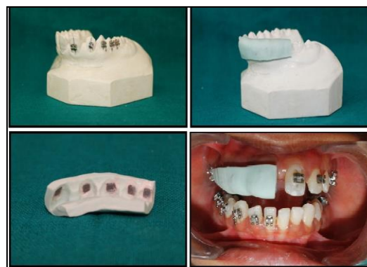
Fig. 1. Indirect bonding procedure- Bracket placement and positioning on working models, transfer tray fabrication, transfer tray with brackets

Follow-up: The patients were evaluated every 3 weeks in order to assess loose brackets for a period of 6 months. All bond failures was noted on each patient's record taking into account the side (right and left), arch (maxilla and mandible), date (day/month/year), and position (tooth). A photographic record was taken in case of bracket detachment with Nikon D3100 Optical Zoom Camera in a JPEG picture format with each photo dimension of 3984 x 2240. Each photograph was analyzed at 40X magnification for assessment of Adhesive Remnant Index 9 (Fig 2). The loose brackets were replaced by new brackets or rebonded using the direct bonding technique.