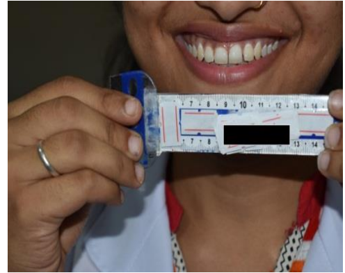
Fig. 2: An example of smile with high lip line and multiple gaps between teeth