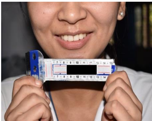
Fig. 1: An example of photograph of the participant during the posed smile, shaded part contains the code number, age and gender of the participant

Parallelism was studied whether incisal edge of maxillary anterior teeth are parallel to upper border of lower lip, or in straight line or in reverse relation. In smile, we also studied whether lower lip touches, does not touch or even covers the incisal edges of maxillary anterior teeth. Number of teeth exposed include whether canines, premolars or molars are seen or not during smile. In assessing the deviation factors (Fig. 2), we checked for presence of midline diastema, multiple gaps, interincisal gap, and canting of upper lip during smile.