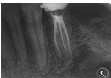
Fig. 3: Obturated additional canals