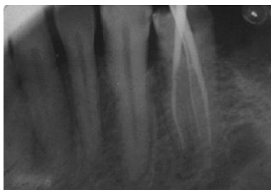
Fig. 2: Obturated buccal and lingual canals