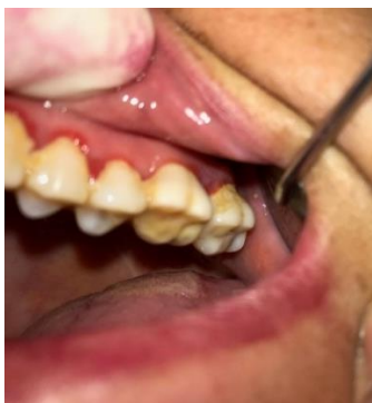
Fig. 4: Post-Operative examination after 15 days shows uneventful healing

The treatment options for peripheral ossifying fibroma include excision of tissue with laser, electrocautery etc. In the present case, after the elimination of local etiological factors such as plaque and calculus via scaling and root planning (SRP), the patient was recalled after 15 days. Local anaesthesia (1:80,000 adrenaline) was administered and gingivectomy incision was given to achieve complete excision of the gingival growth. To prevent recurrence, root planing and thorough curettage was performed. The patient was educated and motivated to maintain proper oral hygiene. The healing was uneventful when evaluated after 15 days (Fig. 4).