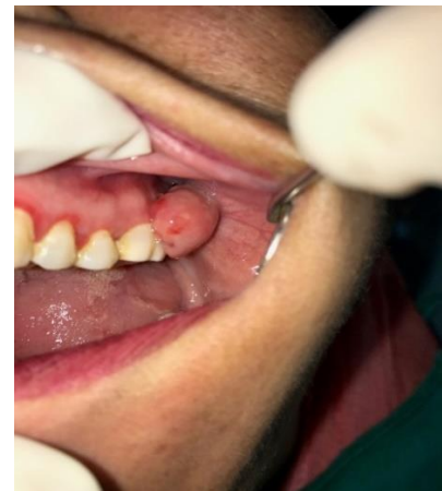
Fig. 1: Intraoral inspection shows the dome shaped growth on the maxillary posterior gingiva

A 38 year old female patient reported to the Department of Periodontics with a chief complaint of a slowly growing, painless, gingival growth in the maxillary posterior region extending from 25 to 27 since 6 months. On eliciting the history, the patient first noticed the swelling 3 months back, which was insidious in onset. There was no history of pus, blood or watery discharge or color change noted over the swelling. On inspection, the overgrowth was dome shaped; measuring approximately 1.5 cm × 2 cm in size and the overlying mucosa was reddish pink in color (Fig. 1). No ulceration was observed. On palpation, the growth was non-tender, firm in consistency and not fixed to the underlying tissue. Bleeding on probing was present. Considering the history and the examination findings, the differential diagnosis included Peripheral giant cell granuloma and Peripheral Ossifying fibroma. Surgical excision of the lesion was performed under local anesthesia and the tissue was subjected to histopathological evaluation. (Fig. 2).