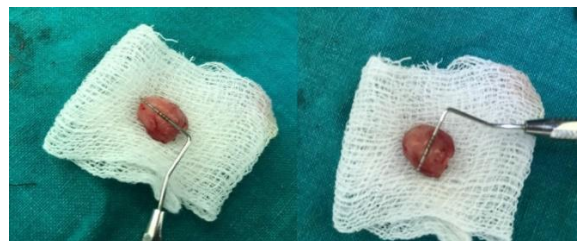
Fig. 2: Biopsy specimen sent for histopathological evaluation