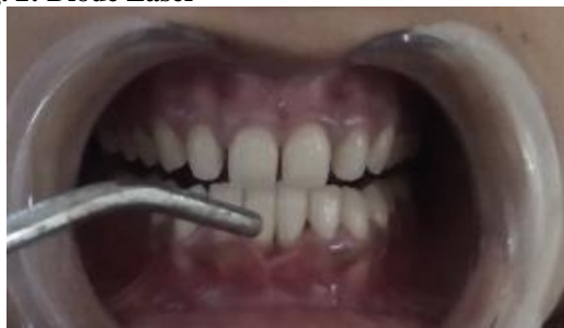
Fig. 3: Air blast test