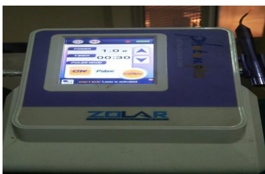
Fig. 2: Diode Laser