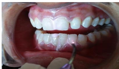
Fig. 6: Laser application w.r.t. 31, 32, 41, 42