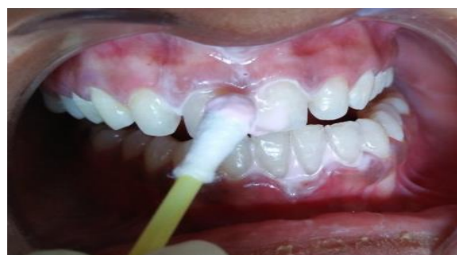
Fig. 5: Paste applied with cotton swab