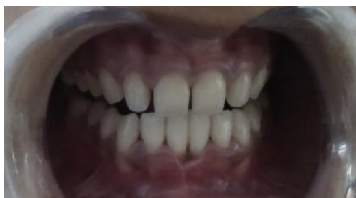
Fig. 4: Area where paste was applied