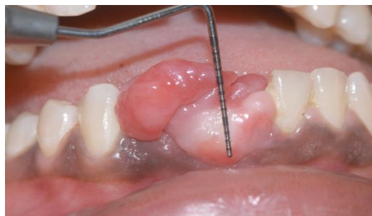
Fig. 3: Vertical measurement