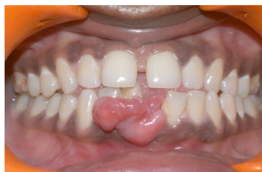
Fig. 1: Gingival enlargement in lower anterior region

Color was pale pink with smooth surfaces and well defined edges. Pathologic migration of 31 and 41 was present. On palpation, swelling was non-tender, sessile and firm in consistency.