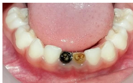
Fig. 1: Intra oral examination showing presence of fully erupted teeth with brownish and blackish discoloration corresponding to position of teeth 71 and 81

The intra oral examination revealed the presence of fully erupted teeth with brownish and blackish discoloration corresponding to position of teeth 71 and 81 (Fig. 1). The teeth were smaller in overall dimension than the corresponding primary teeth with the presence of hypocalcified and hypoplastic enamel that were firmly attached to the alveolus exhibiting no mobility. Moreover, all the other primary teeth showed normal color, appearance and eruption pattern. The radiographic examination revealed the erupted teeth were 71 and 81, the mandibular primary central incisors. These teeth showed thin shell of hypoplastic enamel and dentin with poorly outlined short roots giving a ghost-like appearance. The pulp chambers were large with the wide root canals as the hypoplastic dentin was thin and seemed to be just serving the outline of the image of the root (Fig. 2). Based on the clinical and radiographic findings, a diagnosis of retained natal teeth was made.