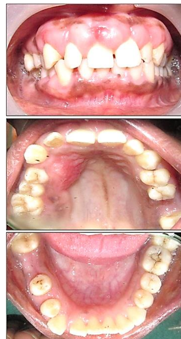
Fig. 4: Four months after change of drugs and SRP

During patient's subsequent visit, significant reduction in gingival overgrowth was noticed in maxillary posterior and mandibular teeth. Some amount of gingival overgrowth was still present in the maxillary anterior sextant, for which flap surgery was planned (Fig. 4).