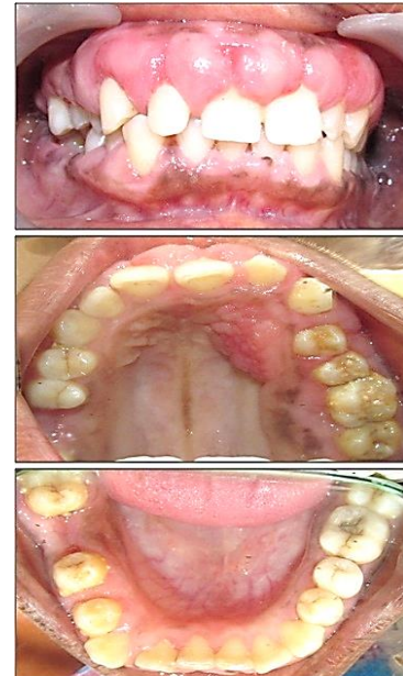
Fig. 3: Two months after the change of drug and non-surgical periodontal therapy

Following 2 months, moderate reduction in the gingival overgrowth was noticed in maxillary anterior region, but patient was not maintaining the oral hygiene (Fig. 3). Scaling and root planing was performed and oral hygiene instructions were reinforced and patient was motivated to perform good oral hygiene and was asked to report after 2 months.