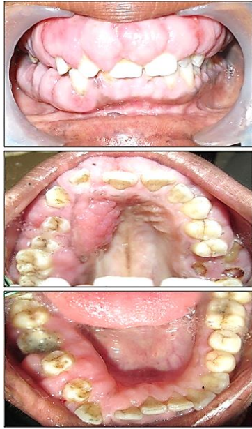
Fig. 2: Intraoral view

The gingival overgrowth showed pebbled surface with some areas having firm and leathery consistency while the other areas having soft and oedematous consistency as a result of secondary inflammatory changes due to the presence of abundant local factors with spontaneous bleeding on probing. Generalized periodontal pockets were present with generalized mobility of teeth. Deep carious lesions were present in relation to 26 and 46. Radiographic examination showed generalized bone loss, case was diagnosed as generalized chronic periodontitis with combined (phenytoin – induced and inflammatory) gingival overgrowth.