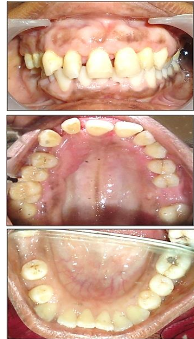
Fig. 7: One – month post-operative

Satisfactory healing was seen one-week post-operative. Significant reduction in gingival overgrowth was seen one-month post-operative with reappearance of the gingival pigmentation (Fig. 7).