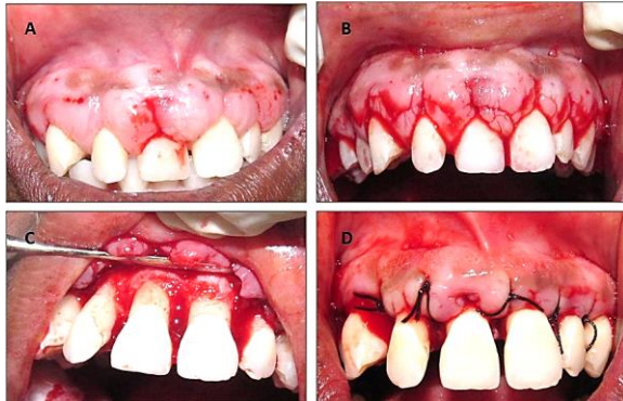
Fig. 5: (a) Pockets marked with a pocket marker (b) Internal bevel and intracrevicular incisions given (c) After removal of excess tissue and debridement (d) Sutures placed

were made from 13 to 23 (Fig. 5b) followed by flap elevation, after which an inter-dental incision was given to remove the excess tissue. The area was debrided, root planing was done (Fig. 5c) and sutures were placed after approximation of the flaps (Fig. 5d). Post-operative instructions were given, antibiotics and analgesics were prescribed and patient was recalled after 1 week for suture removal.