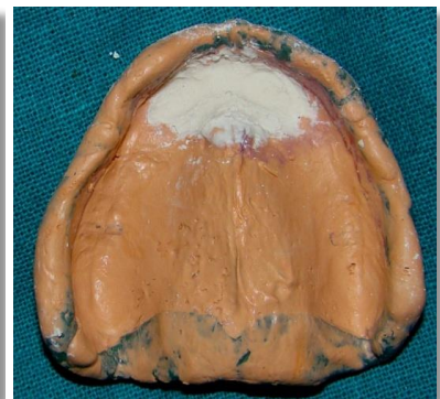
Fig. 3: Final impression of maxillary arch