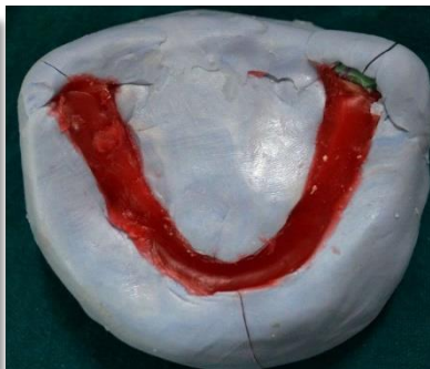
Fig. 5: Putty index