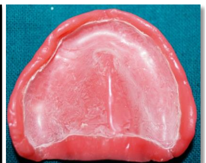
Fig. 9: Denture with 1.5mm sheet