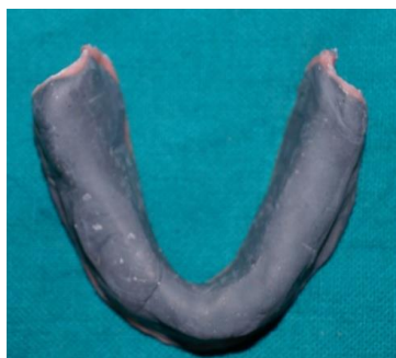
Fig. 4: Neutral zone record