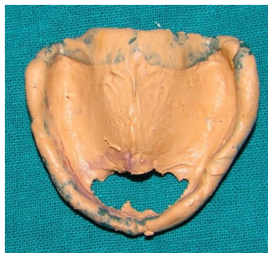
Fig. 2: Window created for flabby tissue