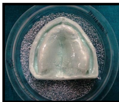
Fig. 8: 1.5mm bioplast sheet adaptation