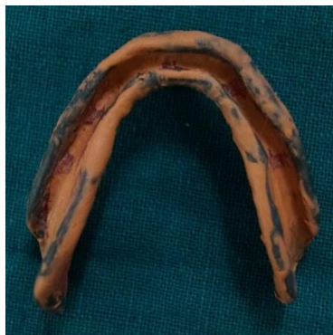
Fig. 1: Final impression for mandibular arch

sheet was marked on the cast. Another sheet of 0.5mm thickness was adapted over this cast (Fig. 11). Earlier adapted sheet of 1.5mm thickness was carefully separated from denture and latter is adapted to create a space of 1.0mm for liquid. The junction of the sheet and the acrylic was carefully sealed with the help of light cure acrylic. Two holes were made in the distobuccal region on maxillary denture and glycerin was injected through these inlets (Fig. 12). They were closed with light cure acrylic resin. Denture was checked for any sharp points, roughness and leakage. Follow up of patient was done after 24hours to check for any soreness.