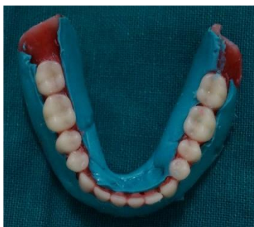
Fig. 7: Impression of polished surface