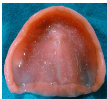
Fig. 13: Maxillary final impression