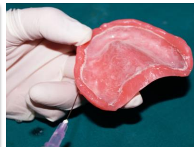
Fig. 12: Injecting glycerin