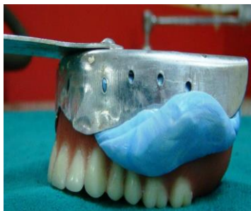
Fig. 10: Silicone impression of tissue side