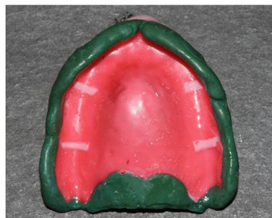
Fig. 1: Border molding using low fusing impression compound type i b

1. One step border molding using low fusing impression compound type i b: low fusing impression compound type i b available in the form of stick was finely powdered using a mortar and pestle. A 5cc syringe was then filled with the powdered compound. The compound was then softened by placing the syringe into a water bath with temperature maintained at 80°C. 6 The softened compound was then syringed onto the borders of the tray .Border molding was accomplished by manual manipulation of the soft tissue adjacent to the borders to duplicate the contour and size of the vestibule.[Fig.1]