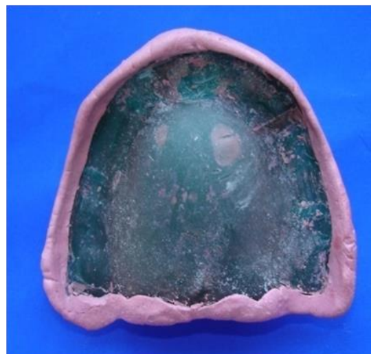
Fig. 3: One step border molding using modified zinc oxide eugenol impression paste

3. One step border molding using modified zinc oxide eugenol impression paste: modified zinc oxide impression paste was used for border molding. The filler content was increased to add to the bulk of the paste and amount of catalyst was also increased to allow faster setting of the material. The base paste and the catalyst paste were dispensed onto a glass slab and mixed with a spatula. The mixed paste was then loaded into a 5 cc syringe and syringed onto the tray borders and border molding was accomplished by manual manipulation as described earlier.[Fig.3]