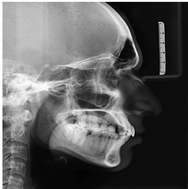
Fig. 2: Type 6 soft palate (Crook-shaped)