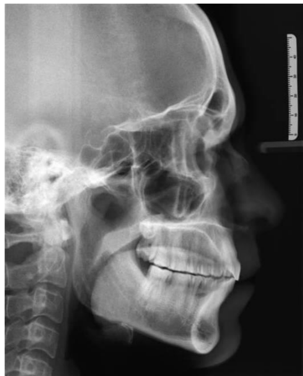
Fig. 3: Type 3 soft palate (Butt-shaped)