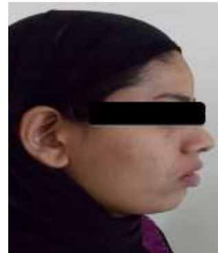
Fig. 1h: Extraoral pre-treatment photograph