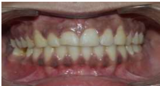
Fig. 4a: Intraoral post-treatment photograph