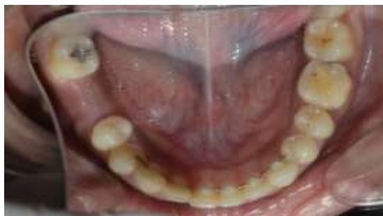
Fig. 4e: Intraoral post-treatment photograph