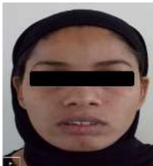
Fig. 1f: Extraoral pre-treatment photograph