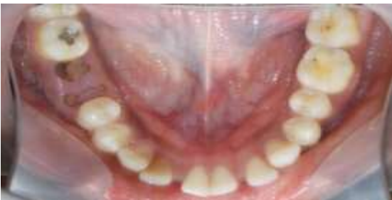
Fig. 1e: Intraoral pre-treatment photograph