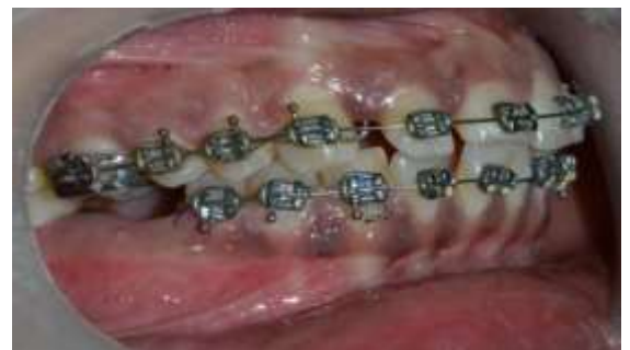
Fig. 3a: Treatment progress