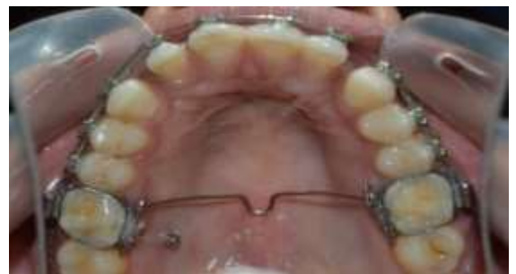
Fig. 2: TPA & palatal implant for molar intrusion