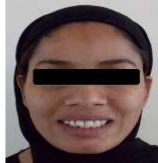
Fig. 1g: Extraoral pre-treatment photograph