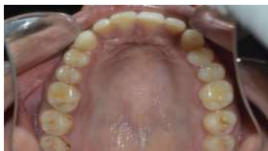
Fig. 4d: Intraoral post-treatment photograph