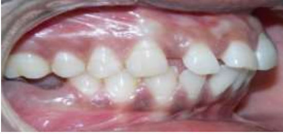
Fig. 1b: Intraoral pre-treatment photograph