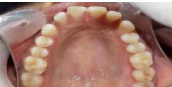
Fig. 1d: Intraoral pre-treatment photograph