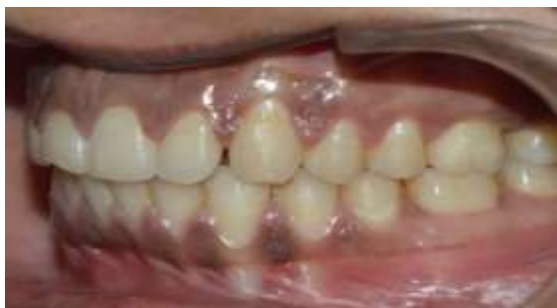
Fig. 4c: Intraoral post-treatment photograph