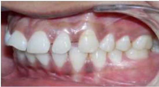
Fig. 1c: Intraoral pre-treatment Photograph