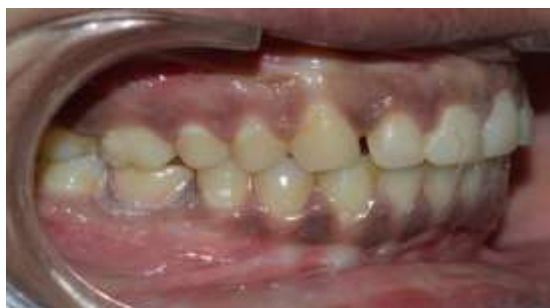
Fig. 6: Removable retainer with prosthesis