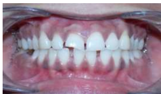
Fig. 1a: Intraoral pre-treatment photograph