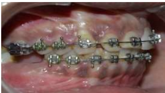
Fig. 3b: Treatment progress