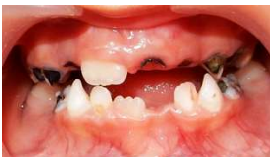
Fig. 1: Pre-operative picture