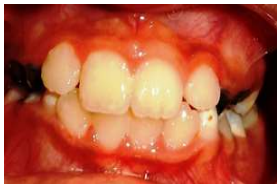
Fig. 2: Follow up post-operative picture

equilibrium followed by extraction of 52. The extraction was done 60 minutes after the infusion of Anti-haemophilic Factor (Inj. Immunate, 250 IU). The local haemostatis was achieved using Tranexamic Acid (TexidInj, 500 mg/5ml). Post extraction instructions were imparted and Acetaminophen 125 mg (15mg/kg/dose) analgesic was prescribed. The routine follow up of the child was done after 24 hours to check for post-operative bleeding. The child is presently undergoing conservative dental treatment involving restorations of the several carious primary and permanent teeth (Fig. 2). The complete treatment of the patient is a teamwork being done in close collaboration with the Haematologist.