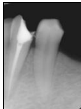
Fig. 1: Pre-operative radiograph showing overextended root canal filling

over-extended root canal filling and retreatment was planned for the pretreated canine. As the patient was traumatized and apprehensive because of her past experience, rubber dam application could not be accomplished.