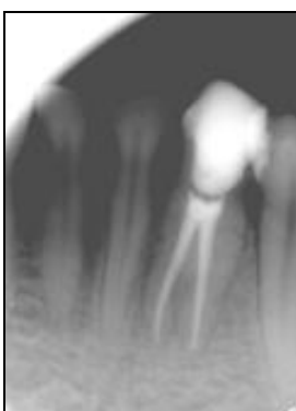
Fig. 4: Post-operative radiograph