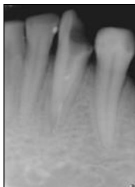
Fig. 2: Radiograph showing presence of two roots

Protaper guttapercha (Dentsply Maillefer) using AH plus sealer (Dentsply Maillefer). A post-operative radiograph was taken which showed dense root canal filling (Fig. 4).