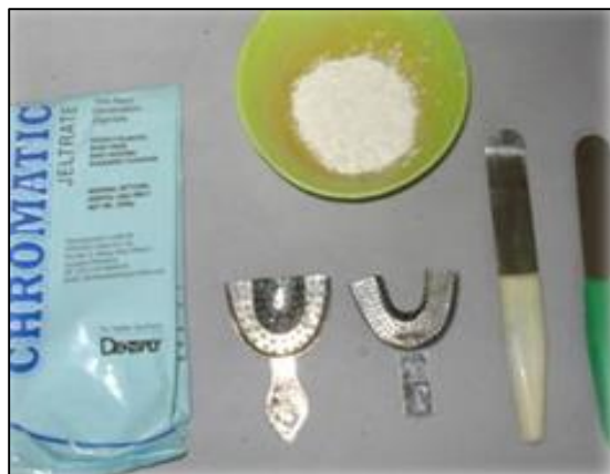
Fig. 1: Materials used for impression making

The study sample comprised of dentitions from 100 individuals (50 females and 50 males), all young adults between 18 and 28 years of age. All subjects were either enrolled as students or employed as faculty in our institution and originated from this region. Following informed verbal consent, impressions of the teeth were made using alginate material and the casts poured in dental stone (Fig. 1, 2).