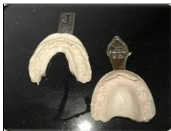
Fig. 2: Final impression of both the arches

Mesiodistal (MD) and buccolingual (BL) dimensions of all teeth, except third molars, were measured on the casts using a Vernier caliper device calibrated to 0.01 mm. The third molars were excluded for an obvious reason of having a wide range of anatomical variations. The MD dimension was defined as the greatest distance between contact points on the approximate surfaces of the tooth crown and was measured with the caliper beaks placed occlusally along the long axis of the tooth. 16 In cases where teeth were rotated or misaligned, measurements were taken between points on the approximate surfaces of the crown where it was considered that contact with adjacent teeth would normally occur. The BL measurement was defined as the greatest distance between the labial/buccal surface and the lingual surface of the tooth crown measured with the caliper held at right angles to the MD dimension. 17