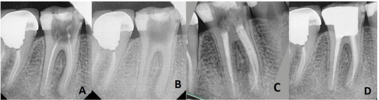
Figure 2: Case 2: A): Preoperative radiographic image; B): Removal of gutta percha from canals; C): Postoperative radiograph; D): 6 months follow up radiograph