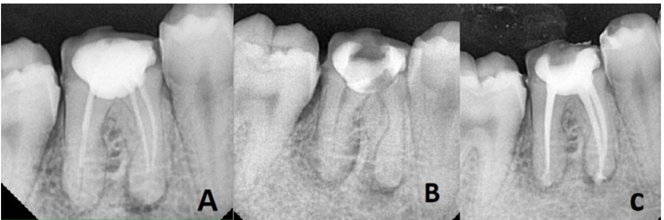
Figure 3: Case 3: A): Preoperative Radiograph; B): After gutta percha removal; C): Post obturation image