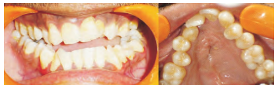
Figure 2 : Pre Treatment Intraoral

Radio graphical examination using a lateral cephalogram and OPG was done. On doing the cephalometric analysis (Fig:3) it was found that the patient had skeletal Class III malocclusion because of retrognathic maxilla and prognathic mandible with prominent chin. Mandibular basal length was also increased with short ramal height. There is steep mandibular plane and gonial angle with severe increase in lower anterior facial height (LAFH). Sassouni's skeletal analysis revealed that the palatal, occlusal and mandibular plane are divergent. There was increase in posterior