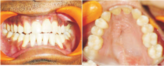
Figure 7 : Post Treatment Intraoral