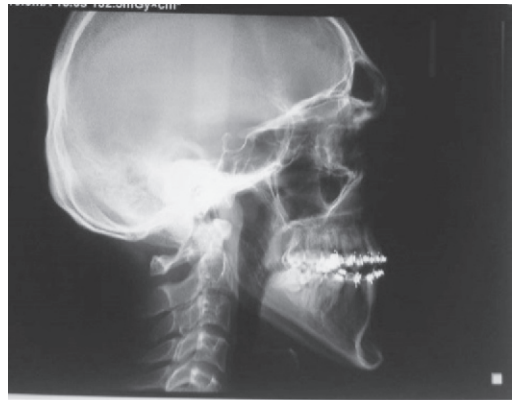
Figure 4 : Mid Treatment Lateral Cephalogram

along with coordination of lower arch. The severe open bite was corrected by intrusion of upper and lower molars along with supra eruption of upper and lower anterior teeth thereby rotating the occlusal plane anti clockwise.(Fig:4,)