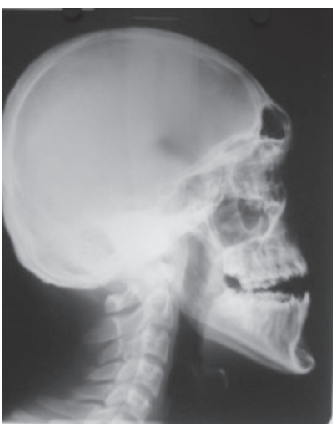
Figure 3 : Pre Treatment Lateral Cephalogram

maxillary height in vertical plane along with supra eruption of maxillary and mandibular second molars resulting in downward and backward rotation of mandible. Dentally, there was proclination of lower anteriors with normal angulation of upper anteriors with respect to SN plane. OPG Examination revealed all compliment of teeth (except upper lateral incisors) with vertically impacted maxillary and horizontally impacted mandibular third molars. The condyles appeared normal in size and form.