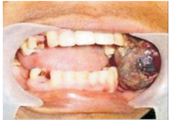
Figure 2: Showing a pedunculated reddish black mass arising from the extracted socket of 24.

suggested a provisional diagnosis of central giant cell granuloma.