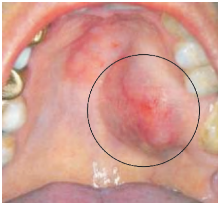
Figure 1 : Showing swelling from 23-27 region.

Extraorally, the swelling measured around 2x2cms . It was firm in consistency, tender on palpation and the overlying skin appeared stretched and shiny. There was associated lymphadenopathy. Intraorally, the swelling extended anterioposteriorly from distal aspect of 23 to distal aspect of 27 (Fig. 1). Lateral extension revealed the obliteration of the buccal vestibule, medially up to the midpalatal area. A root stump was present in relation to upper left first premolar.