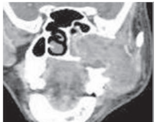
Figure 3: showing large expansile lesion arising from the lateral wall of the superior alveolus of the maxilla of the left side, extending into the left maxillary sinus and eroding all the walls of the maxillary sinus

Additional investigations were done that included hematological investigation which revealed increase in blood glucose and ESR levels. Radiographic investigations of paranasal sinus showed haziness of the left maxillary sinus, with erosion of infra orbital, medial and lateral walls. Computed tomography revealed a large expansile lesion arising from the lateral wall of the superior alveolus of the maxilla of the left side, extending into the left maxillary sinus and eroding all the walls of the maxillary sinus (Fig. 3). CT morphology suggested the possibility of a giant cell tumor.