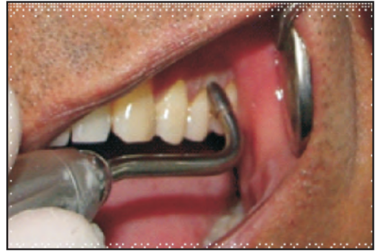
Fig. 2 (TEST SITE)