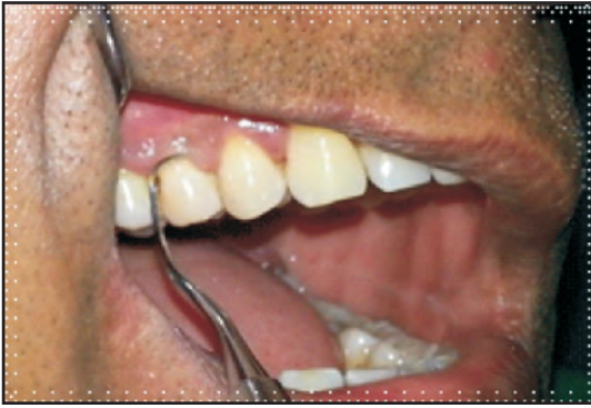
Fig. 1 (CONTROL SITE)