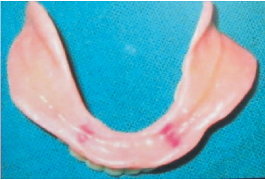
Fig. 6: Markings transferred to mandibular denture