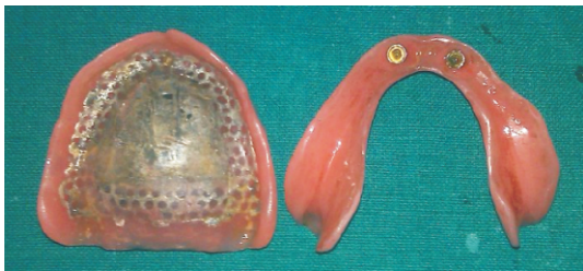
Fig. 7: Intaglio surface of final dentures