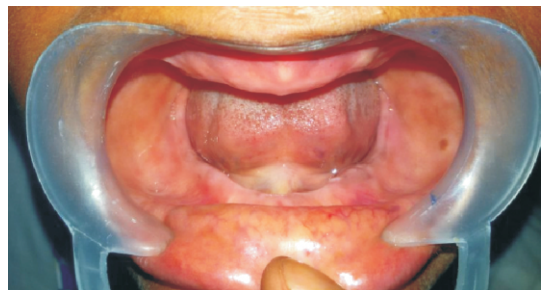
Fig. 2: Intra-oral pre operative photograph