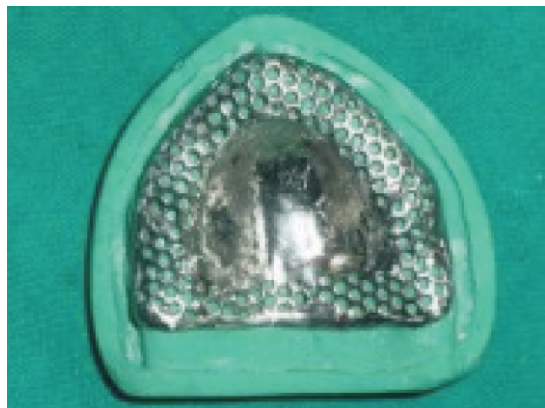
Fig. 4: Finished and polished metal framework