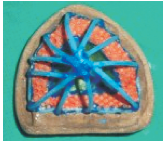
Fig. 3: Fabrication of wax pattern