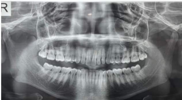
Fig. 3: Showing two lateral incisor on the left maxillary arch with proper pulp chambers and one root canal each.

germ that may cause fusion of two tooth buds or separation of single tooth bud into two are hereditary or congenital diseases, nutritional deficiency, local traumas, infectious/inflammatory processes, ionizing radiation, endocrine influences, excessive ingestion of medicines. 2