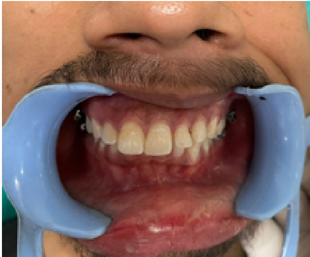
Fig. 1: Showing midline shift towards right side in the maxillary arch.