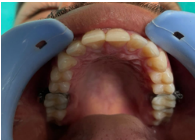
Fig. 2: Showing midline shift towards right side in the maxillary arch along with two lateral incisors on the left side.