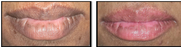
Fig. 1: Case 1 - Pre and post-operative pictures