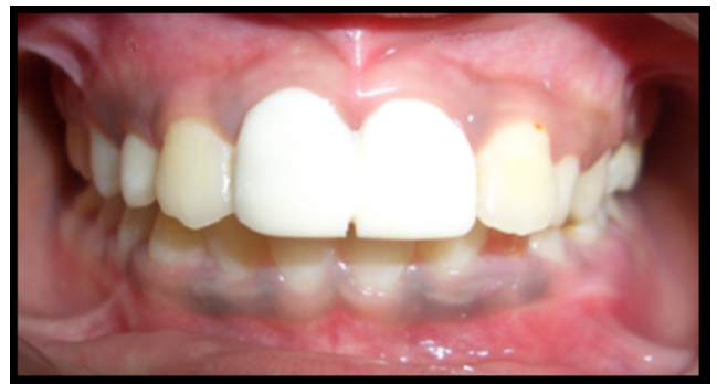
Fig. 8: Polycarbonate Crown placement wrt 11,21.

and it also allows microleakage which leads to the chances of reinfections. It also takes a long time (12-24 months) to form hard barrier. 9 Due to these reasons, MTA is being used widely as a suitable material for apexification. 5