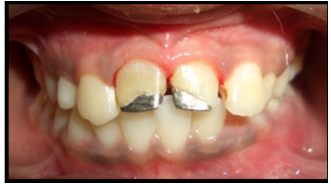
Fig. 7: Post and core restoration in place