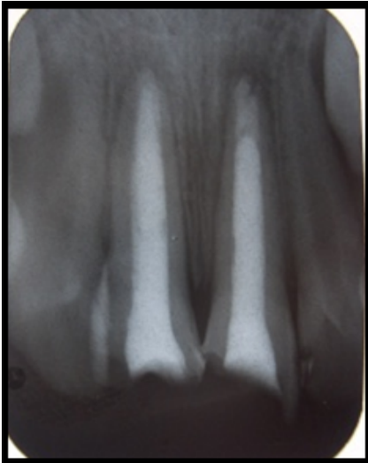
Fig. 4: Obturation done with gutta percha