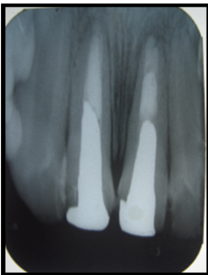
Fig. 6: Metal posts placed