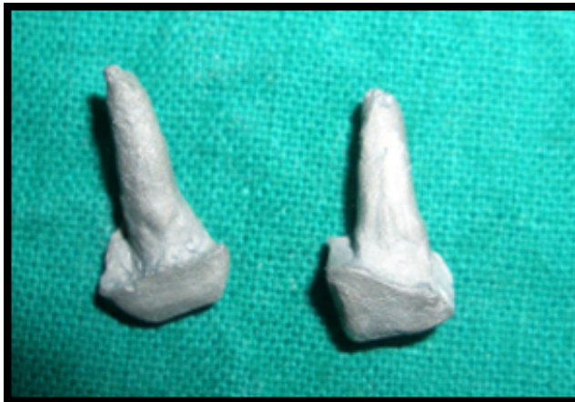
Fig. 5: Metal posts fabricated