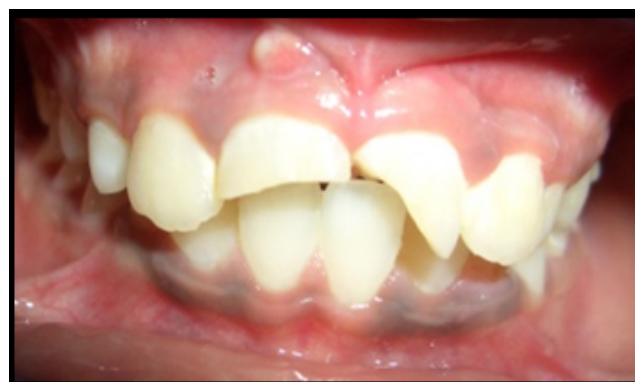
Fig. 1: Pre-operative photograph showing fractured 11,21. Periapical sinus tract formation wrt 11.

In Endodontics, the success of the treatment depends on obtaining an impervious seal in the apical area of the tooth. Endodontic management of non-vital young permanent teeth affected by traumatic injury is complex due to the presence of open apices with thin walls of dentin, pulp necrosis, and divergence of root canals. 8 Apexification is the procedure of forming a hard tissue artificial barrier at the apex of the tooth. Over the years, apexification with calcium hydroxide has gained a lot of popularity but lately, a few studies indicate that the barrier formed with calcium hydroxide is incomplete. It has a swiss cheese appearance