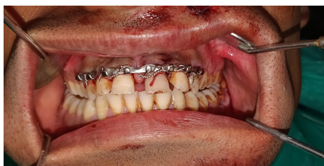
Fig. 3: (Immediate post operative picture showing repositioning and splinting of involved teeth)