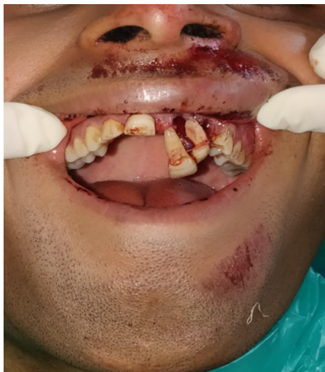
Fig. 1: (Intrusive luxation of maxillary right central incisor and avulsion/ exarticulation of maxillary left central and lateral incisors)