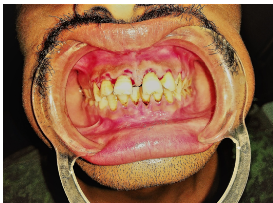
Fig. 4: (6 weeks post operative, immediately after arch bar removal)