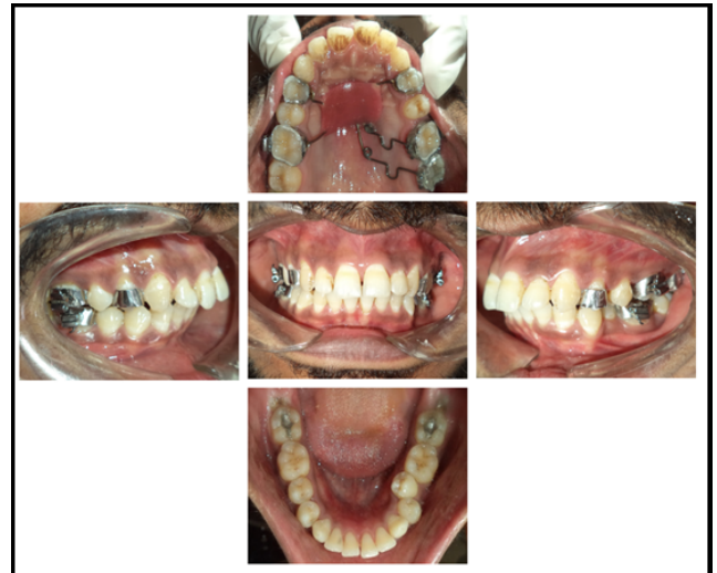
Fig. 2: Pendulum Appliance

Maxillary 1 st premolars, 1 st molar and 2 nd molars both right and left sides were banded and Pendulum Appliance with 0.032 TMA wire was fabricated and attached (Figure 2). The appliance was activated by 90° to deliver a force of 220 grams. After the desired distalization was achieved in 2-4 months, appliance was kept in place for 2 months to retain the distalization effect, followed by placement of Nance palatal arch. Fixed mechano therapy by bonding with 0.018 MBT was initiated. Alignment and levelling in the both arches was carried out by following wire sequence: (a) 0.016" heat activated nickel-titanium arch wires (b) 0.016x0.022" nickel-titanium arch wires (c) 0.016x0.022" SS arch wires (d) 0.017x0.025" NiTi arch wires (e) 0.017x0.025" SS arch wires. The arch wires were cinched distal to molar to avoid maxillary and mandibular incisor proclination. Treatment was completed in 18 months. After debonding patient was given essix retainer and follow up was done for next 6 months.