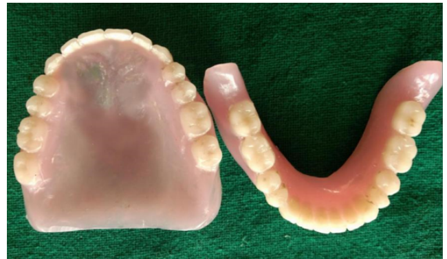
Fig. 4: Finished denture