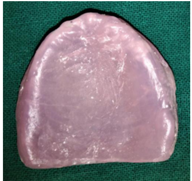
Fig. 3: Rugae area replicated on the polished palatal surface.