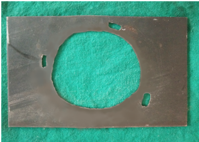
Fig. 1: A two millimeter thick metal plate designed to fit in between the drag and the cope of the flask.