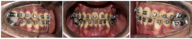
Fig. 12: Intra oral post splint photograph