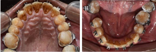
Fig. 13: Bracket placement and the adhesive bite-blocks