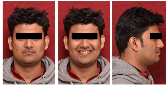
Fig. 1: Pre-treatment extra oral photographs

(Figures 8, 9 and 10). After deprogramming, the patient's face looked more symmetric than pre-treatment (Figure 11). The new mandibular position (Figure 12) was then retained by bite-blocks (Figure 13).