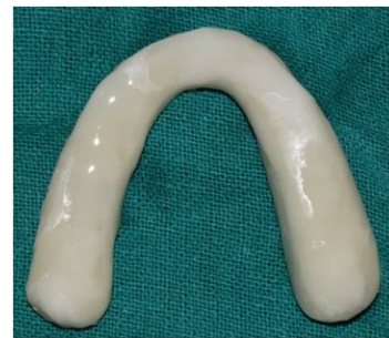
Fig. 9: Cold-cure acrylic maxillary splint