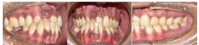
Fig. 2: Pre-treatment Intra oral photograph