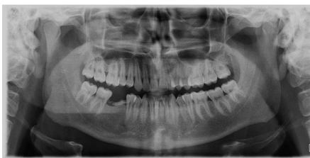
Fig. 6: Pre-treatment OPG