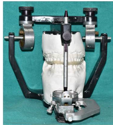
Fig. 8: Casts with maxillary splint