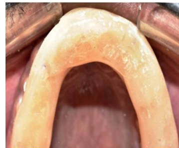
Fig. 10: Cemented maxillary splint

Minor facial asymmetry is common and can be observed in every individual. Facial asymmetries can be classified as either developmental (agenesis, hypoplasia, or hyperplasia of the facial bones) or acquired (resulting from trauma, infection, or functional shifts). 4 Functional shift due to CR-CO discrepancy is challenging type of malocclusion for orthodontists. In present case facial asymmetry was due to functional shift. Patient had a CR-CO discrepancy resulting from the MFS which was caused by the discrepancy of the dental arch forms and the occlusal interferences. His mandible was forced to shift to the right to establish a workable occlusion; this suggested