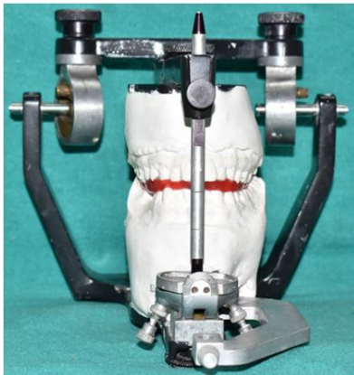
Fig. 7: Articulator mounted models