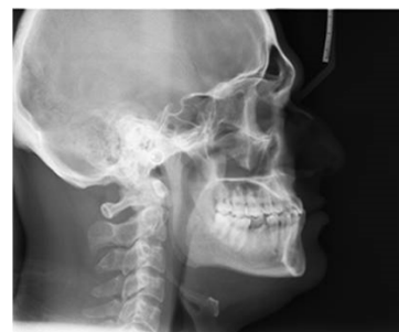
Fig. 4: Pre-treatment lateral cephalogram