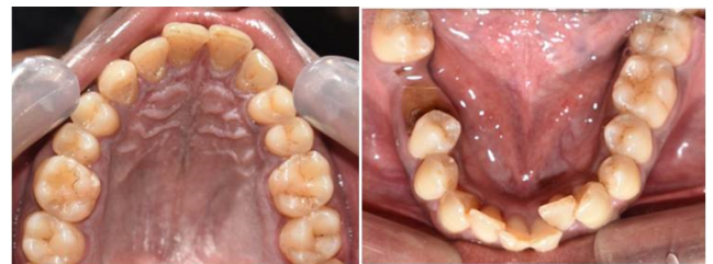
Fig. 3: Pre-treatment Intra oral photograph