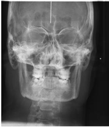
Fig. 5: Pre-treatment PA-Ceph