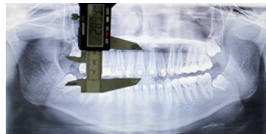
Fig. 2: Post-treatment tooth length