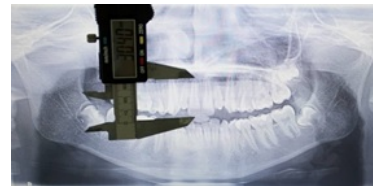
Fig. 1: Pre-treatment tooth length

Overjet had a positive correlation with external apical root resorption in maxillary and mandibular anterior teeth in the present study. This can be because of the correction of large overjet. This finding can also be seen in some studies. 13-15 To correct large overjet, anterior teeth were moved long distances to reduce maxillary anterior protrusion and active torque with rectangular wires was also given, which resulted in external apical root resorption. but, according to Jung et al., there was no correlation between the overjet and root resorption. 17