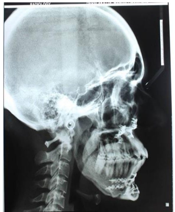
Fig. 22: Post Treatment Cephalogram