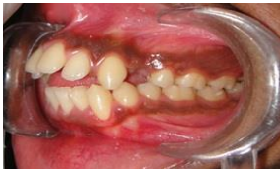
Fig. 6: Pre Treatment Intra Oral Images