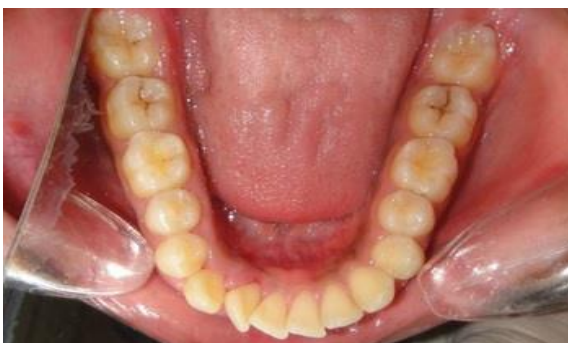
Fig. 8: Pre Treatment Intra Oral Images