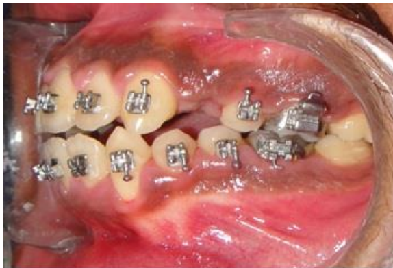
Fig. 12: Pre Surgical Images