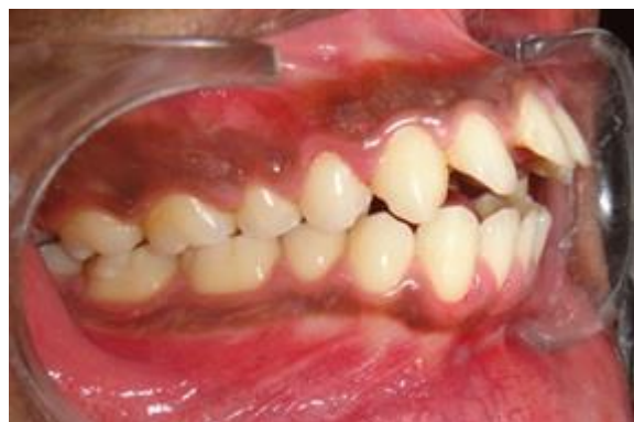
Fig. 4: Pre Treatment Intra Oral Images