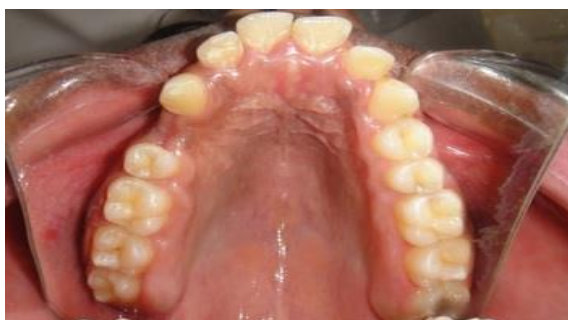
Fig. 7: Pre Treatment Intra Oral Images