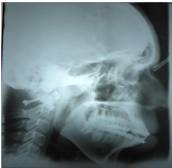
Fig. 9: Pre Treatment Lateral Cephalogram