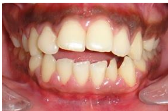
Fig. 5: Pre Treatment Intra Oral Images