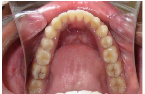
Fig. 17: Post Treatment Intra Oral Images