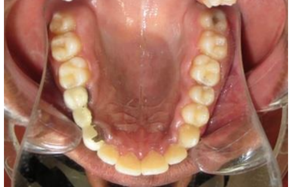
Fig. 16: Post Treatment Intra Oral Images