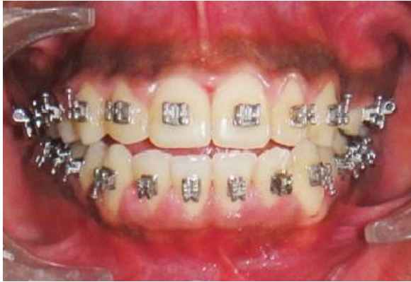
Fig. 10: Pre Surgical Images