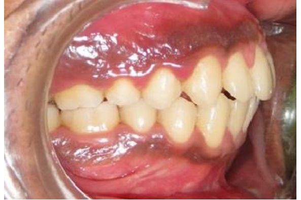
Fig. 15: Post Treatment Intra Oral Images