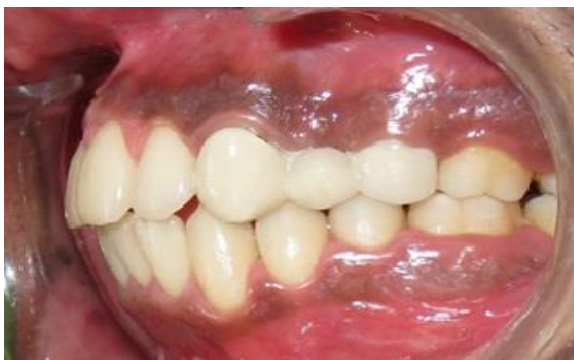
Fig. 13: Post Treatment Intra Oral Images