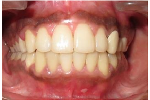
Fig. 14: Post Treatment Intra Oral Images