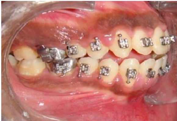
Fig. 11: Pre Surgical Images