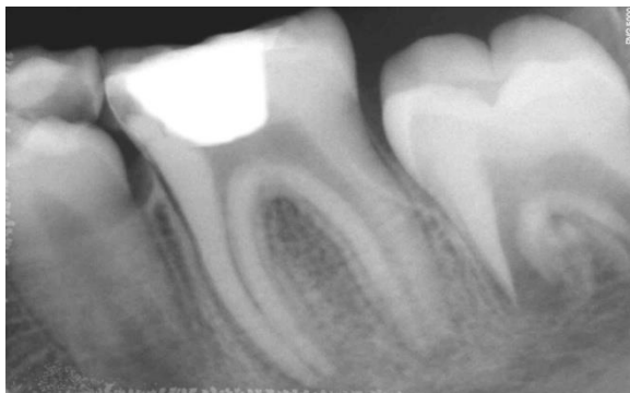
Fig. 2: 6 month follow- up showing continued root development.