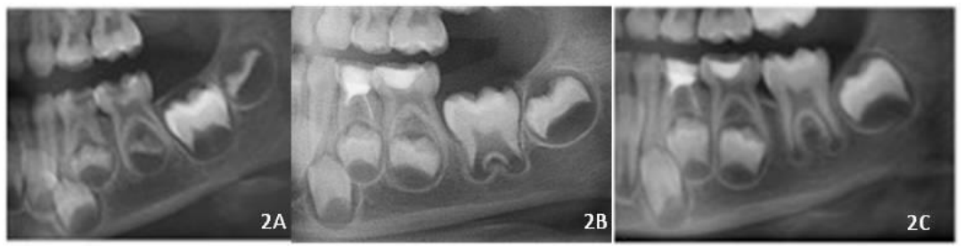
Fig. 2A: Before the treatment of mandibular left deciduous first molar, 2B; Twelve months after treatment, 2C; Thirty months follow up showing a successful prognosis