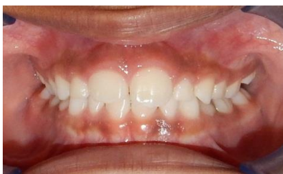
Fig. 5: Permanent successors erupting in normal position after 36 months