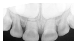
Fig. 2: IOPAR of 51, 61 showing root fracture