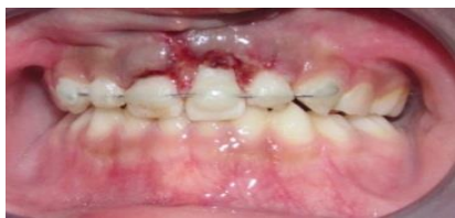
Fig. 3: Primary central incisors stabilized with semi rigid splint using composite resin