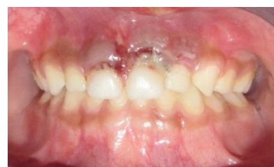
Fig. 1: Preoperative photographs showing traumatized primary central incisors

at an early age, it was decided to preserve the tooth rather than the extraction of the offending tooth. The blood clot was debrided with normal saline, the maxillary primary central incisors were repositioned and stabilized with semi rigid wire-composite splint. (Fig. 3) The patient was instructed to take soft diet for 2-3 weeks and oral hygiene instructions were given. Analgesic syrup was prescribed as and when required. After 4 weeks, swelling subsided with Grade I mobility in the affected teeth. After 2 months, when the mobility was reduced, the splint was removed. The permanent successors were regularly evaluated to observe any developmental defects. After 24 months follow up, the patient was clinically asymptomatic and radiographic examination showed normal physiologic resorption of both the teeth. (Fig. 4) After 36 months follow up, normal eruption of permanent successors was observed with no complications. (Fig. 5)