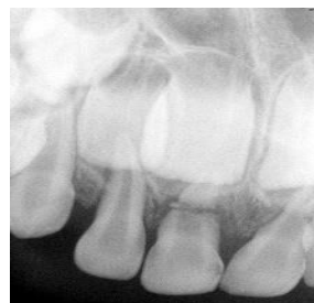
Fig. 6: Preoperative radiograph showing root fracture w.r.t. 51

A 4 year old boy reported to the Unit of Pediatric dentistry with the pain in upper front teeth following an accidental trauma while playing 4 hours back. Extra oral examination revealed bleeding from the upper lip. Intra oral examination revealed Class II mobility in primary incisor, 51. On radiographic examination, there was a radiolucent line in the apical third of right maxillary central incisor and the permanent tooth bud was in Nolla's stage 5 (Fig. 6). Based on the radiographic and clinical findings, a diagnosis of horizontal root fracture in 51 was made. The maxillary primary central incisors were stabilized followed by repositioning with semi-rigid wire composite splint. (Fig. 7) The patient was instructed to take soft diet for 2-3 weeks and oral hygiene instructions were given. Analgesic syrup was prescribed as & when required. After 4 weeks, when the mobility has reduced, the splint was removed. The permanent successors were also followed up regularly to observe any developmental defects. The tooth 61 was symptomatic, root canal was opened and Metapex (Biomed, Korea) was placed and sealed with GIC (GC Fuji II). After 24 months follow up, the patient was clinically asymptomatic and radiographic examination showed normal physiologic resorption of 51. (Fig. 8)