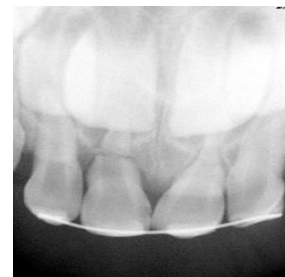
Fig. 7: IOPAR showing splinting with semi rigid wire using composite resin