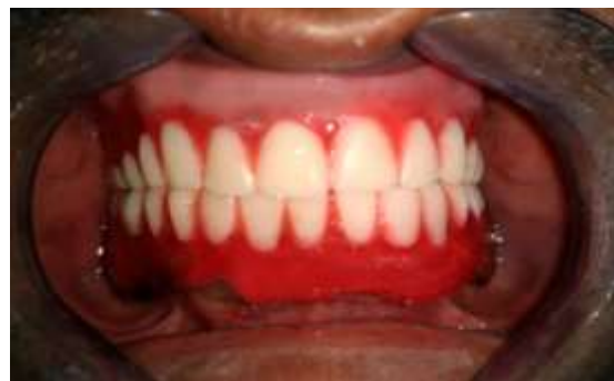
Fig. 9: Try in

The dentures were finished, polished and inserted into the patient's mouth (Fig. 10). Proper oral hygiene instructions along with practice for removal and insertion of the mandibular denture were given to the patient and the patient was recalled for periodic follow up appointments.