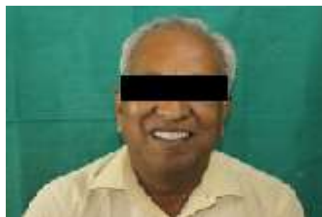
Fig. 10: Final Prosthesis