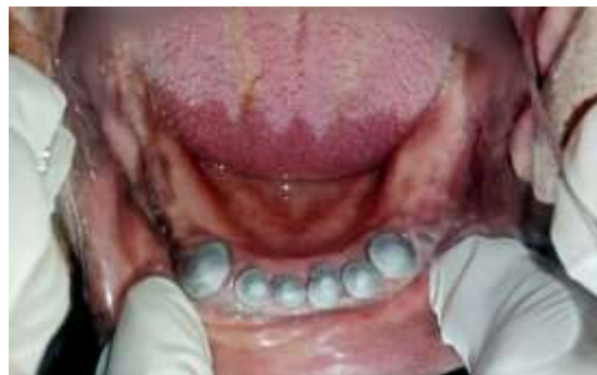
Fig. 4: Metal copings in patient's mouth

A primary impression of the maxillary arch was made with impression compound and a special tray with spacer was fabricated on the primary cast. Using conventional techniques border molding was done and secondary impression was made with zinc oxide eugenol paste (Fig. 5). Cast was poured in die stone and complete denture metal framework was fabricated (Fig. 6).