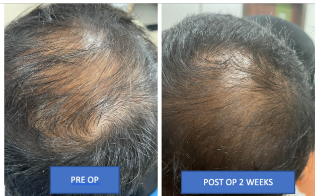
Figure 3: a): Pre-operative; b): Post-operative using growth factor concentrate and derma roller