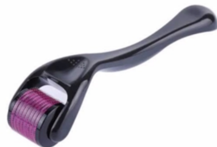
Figure 1: Derma roller (Hair Growth roller with 540 Titanium Alloy Micro Needles 1mm) Lime shot company

Different sizes are available for various body areas. Smaller rollers (e.g., 25mm width) are often used for facial treatments, while larger rollers (e.g., 75mm width) are more suitable for body treatments, including larger areas of the scalp. (Figure 1)