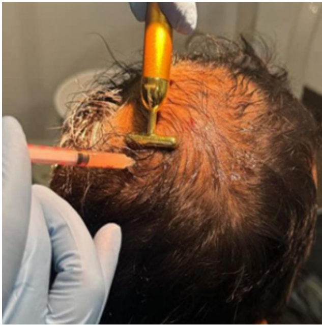
Figure 2: Growth factor concentrate using with derma roller