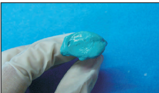
Figure 2 : Final impression of anophthalmic socket

An impression of the anophthalmic socket was made with irreversible hydrocolloid (Zelgan 2002, DENTSPLY) mixed in thin consistency, which was injected into the socket through the hollow stem of the plastic impression tray. The impression was then poured in sections using dental stone (Kalastone, Kalabhai Pvt. Ltd, Mumbai, India). After complete setting the two halves of the cast were separated and a special tray with clear acrylic having hollow passage was fabricated. The patient's eye socket was coated with a thin layer of Vaseline and an impression was made using light viscosity polyvinyl siloxane impression material (Aquasil LV, DENTSPLY) (Figure 2). Patient was asked to do various movements to record all anatomical details of the socket.