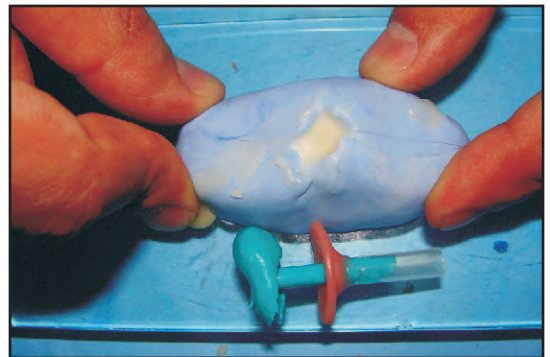
Figure 3 : Putty mould for wax pattern fabrication.

Soft putty consistency polyvinyl siloxane (Aquasil soft putty/regular DENTSPLY) set was wrapped around the final impression to obtain a mould for wax pattern fabrication. Then putty was separated horizontally into two halves. The mould space was ready for wax pattern fabrication into which molten white wax (Surana dental wax Mangalore Dent Corp) was poured through the channel formed by tray handle (Figure 3). When the wax had set the putty mould was separated and the wax pattern was retrieved and carved.