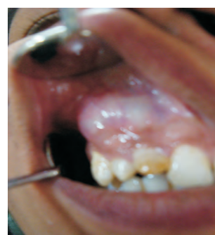
Fig.1. Preoperative picture of lesion.

Extra oral examination showed a solitary diffuse swelling on right ala-tragal line of 1.5cm x 2cm in size causing obliteration of the nasolabial fold which was tender on palpation. Past medical, dental history and general physical examination were non contributory. On intra oral examination, a well defined solitary swelling present in the right upper labial vestibule extending anteriorly from the mesial aspect of 12 till mesial aspect of 13 posteriorly. It measured 2.8cm in size and was bluish in colour. On palpation it was soft, tense, firm to hard in consistency and non tender in nature.