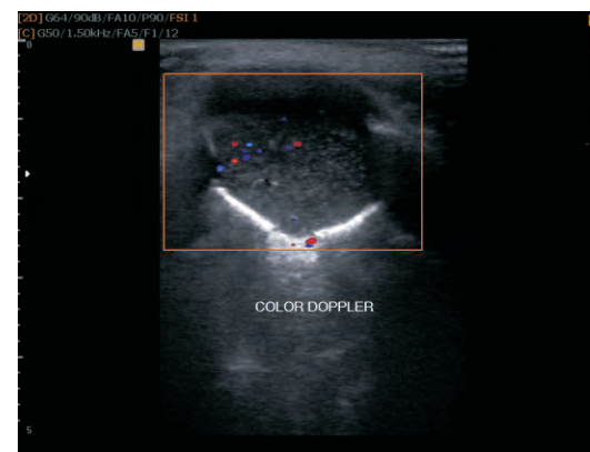
Fig.5. Ultrasonography with colour power Doppler, showing the anechoic area with posterior wall enhancement with absence of vascularity suggestive of cystic lesion.

Ultrasonography with colour power Doppler was performed (Fig.5). It revealed a well-defined round cystic lesion of 2.4x2.2cm in size with thin and smooth margins, posterior acoustic enhancement was present and vascularity was absent, which indicated that it was a cyst.