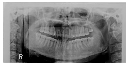
Fig.4. OPG showing a radiolucent area extending from periapex of 11 till 13.

IOPAR showed enamel invagination of crown lined by enamel upto the cemento-enamel junction suggestive of Type I dens invagination, with widened root canal with respect to 12. IOPAR, maxillary occlusal and pantomography, revealed well-defined round radiolucency involving the periapical area of 12 and 13 with sclerotic border of size 1.5x2cm. (Fig.2,3 and 4)