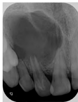
Fig.2. Intraoral periapical radiograph well defined radiolucency with sclerotic border.

Investigative workup included an intra oral periapical radiograph (IOPAR), maxillary occlusal and pantomography, fine needle aspiration and ultrasonography with colour power Doppler.