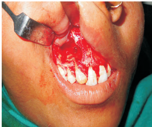
Fig.6. Postoperative picture of lesion

The cystic site was then exposed under local anesthesia following root canal treatment of 12 (Fig.6).