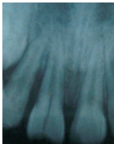
Fig.4: Pre-operative radiograph

The procedural steps performed for this case were similar to case one, with the exception of gingival flap reflection to expose the fractured segment (Fig 5). The gingival flap was sutured back in position after fragment reattachment, followed by composite buildup of the tooth with composite veneering (Fig 6). Ellis Class II fracture in relation to 21 was restored with composite build up (Fig 7). The tooth was clinically and radiographically examined for the first two weeks and then monthly for the next six months. At the end of six months no clinical and radiographic failure was observed.