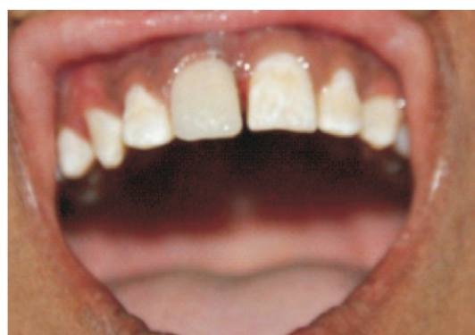
Fig.3: Post composite veneering