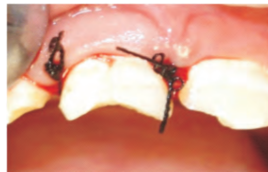
Fig.6: Gingival flap repositioned with sutures