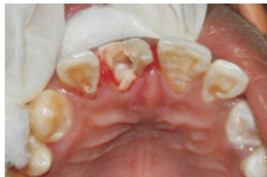
Fig.2: Clinical determination of correct position of reattachment