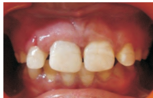
Fig.7: Post composite build-up