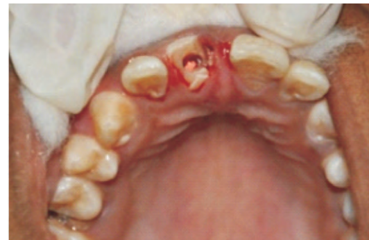
Fig. 1: One third of the gutta-percha removed after obturation.

composite veneering was done (Fig 3). The tooth was clinically and radiographically examined for the first two weeks and then monthly for the next six months, with no signs of clinical or radiographic failure at the end of six months.