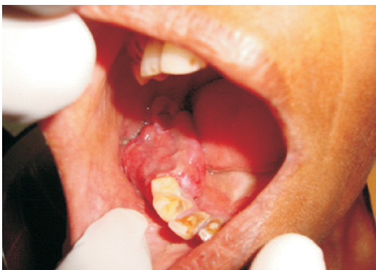
Fig. 1: Intraoral photograph showing swelling on the mandibular right alveolar ridge

A 42 year old female patient presented with a chief complaint of swelling in the right side of the face since from 3 years. The patient was well built and she was a known diabetic since 2 years. She had no other relevant medical history. Intraoral examination revealed a single large growth measuring about 2 x 4 cm is seen in the right side of the alveolar ridge over 45, 46, 47 & 48 regions. The growth was smaller in size initially and has grown gradually to the present size. Overlying mucosa was erythematous and the growth was sessile and confluent with the underlying hard tissue. Growth was firm in consistency and nontender on palpation. Clinically 45, 46 & 47 were missing and 48 was firm but showed slight displacement posteriorly (Fig.1). Patient gave the history of exfoliation of the missing teeth 2 years back. Radiograph showed a radiolucent area with focal radioopacities. Incisional biopsy revealed cellular connective tissue consisting of stellate and spindle shaped cells. Multiple foci of acellular osteoid were noted which resembled the psammoma bodies (Fig. 2). Diagnosis of Psammomatoid ossifying fibroma was arrived at and surgical excision of the lesion was carried out.