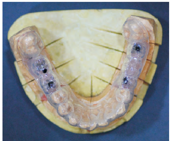
Fig 4: Access hole drilled through stent