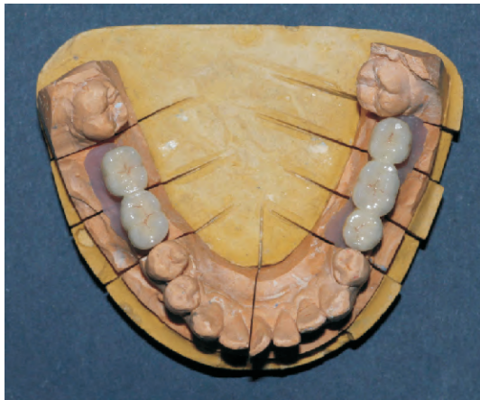
Fig 1: Definitive restorations

This report presents a simple, innovative and cost effective technique using a vacuum formed template to record and store the position of the abutment screw. This rescue template allows accurately locating and accessing the abutment screw in the event of