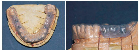
Fig 3: Repositioning stent and marking of access hole