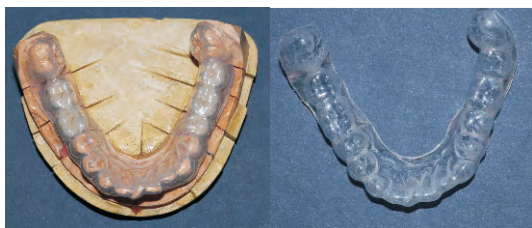
Fig 2: Stent fabricated on working cast