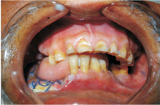
Fig 1(b): Intra-oral picture showing mandibular deviation.

A maxillary and mandibular impression was made by using irreversible hydrocolloid (Zelgan 2002, dentsply, ISO 9001), (Fig. 2a) using a modified stainless steel stock tray. The casts were poured with Type III dental stone (Gypstone Super hard dental Type III) (Fig. 2b). A maxillomandibular record was made by manually assisting the mandible into the centric occlusion. The maxillary and mandibular cast was mounted on a three point articulator.