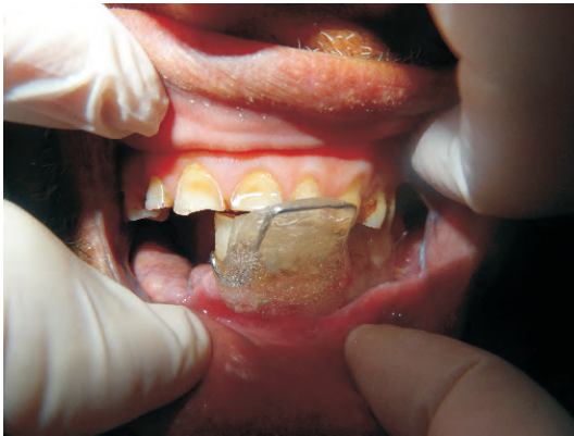
Fig.4: Intraoral view of Guide Flange Prosthesis in place.

definite closing point during mastication. The flange height was adjusted in such a way that it guided the mandible from large opening position (in practical limits of the height of the buccal vestibule) to the maximum intercuspation in a smooth and unhindered path. The prosthesis was delivered and post-insertion instructions were given (Fig. 5).