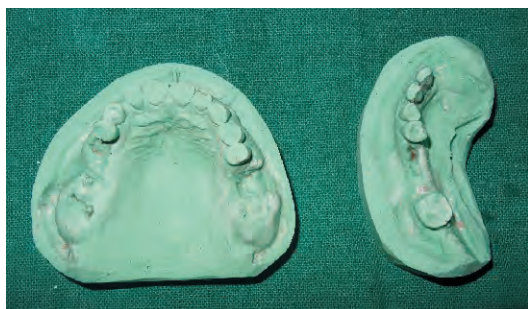
Fig 2(b): Maxillary and Mandibular casts poured using Type III Dental Stone.

The design (Fig. 3) included the guidance flange on the buccal side and the supporting flange on the lingual side. The retention was provided by the interdental clasp, engaging the incisors and the premolars using 21 gauge orthodontic wire (KC Smith and Co, Monmouth, UK). The guide flange extended superiorly and lingually on the buccal surface of the left incisors and the premolars, allowing the normal horizontal and vertical overlap of the left maxillary anterior teeth. The guide flange was sufficiently blocked out, so that it would not traumatize the left maxillary teeth and the gingiva when the patient closed his mouth and subsequently acrylized into the clear heat-polymerized acrylic resin (DPI Heat cure clear; Dental products of India, Mumbai, India) to make the GFP.