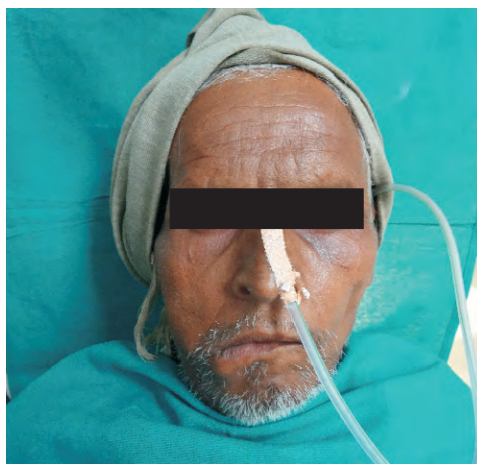
Fig 1(a): Extraoral view showing mandibular deviation

No intermaxillary fixation was done at the time of surgery. Extraoral examination showed facial asymmetry with mandibular deviation to the right side( Fig. 1a ). 6,7 Clinical examination revealed severe deviation of the mandible towards the right side, with lack of proper contact between the maxillary and the mandibular teeth anteriors on the left side. Intra-oral examination revealed thick, freely movable soft tissues with scar formation, loss of alveolar ridge and obliteration of buccal and lingual sulci in the right half of mandibular region. The deviation of mandible was observed towards the reconstructed (right) side (about 10 - 12 mm from midline on 30 mm of mouth opening) on opening due to the action of the normal left mandibular depressor muscles . The patient was able to achieve an appropriate medio-lateral position of the mandible with manual guidance but was unable to repeat this position consistently for adequate mastication. Intra oral examination showed missing teeth 15,16,17, 18, 26,27, 28, 35, 36, 38, 41, 42, 43, 44, 45, 46, 47 and 48 (Fig. 1b). The mandibular defect was classified as Cantor and Curtis Class IV i.e. resection of the lateral portion of the mandible with subsequent augmentation to restore form and function 6