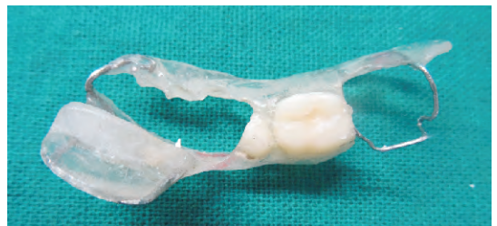
Fig.3: Guide Flange Prosthesis.

The design (Fig. 3) included the guidance flange on the buccal side and the supporting flange on the lingual side. The retention was provided by the interdental clasp, engaging the incisors and the premolars using 21 gauge orthodontic wire (KC Smith and Co, Monmouth, UK). The guide flange extended superiorly and lingually on the buccal surface of the left incisors and the premolars, allowing the normal horizontal and vertical overlap of the left maxillary anterior teeth. The guide flange was sufficiently blocked out, so that it would not traumatize the left maxillary teeth and the gingiva when the patient closed his mouth and subsequently acrylized into the clear heat-polymerized acrylic resin (DPI Heat cure clear; Dental products of India, Mumbai, India) to make the GFP.