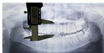
Fig. 1: Pre-treatment tooth length

Overjet had a positive correlation with external apical root resorption in maxillary and mandibular anterior teeth in the present study. This can be because of the correction of large overjet. This finding can also be seen in some studies. 13-15 To correct large overjet, anterior teeth were moved long distances to reduce maxillary anterior protrusion and active torque with rectangular wires was also given, which resulted in external apical root resorption. but, according to Jung et al., there was no correlation between the overjet and root resorption. 17