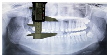
Fig. 2: Post-treatment tooth length