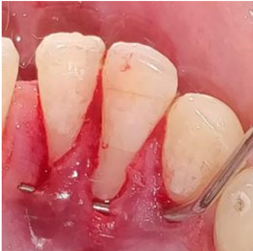
Fig. 2: Tunnel prepared