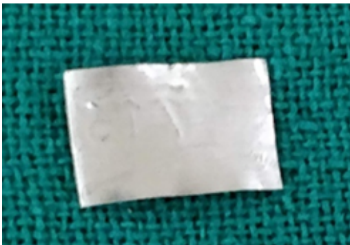
Fig. 3: Template