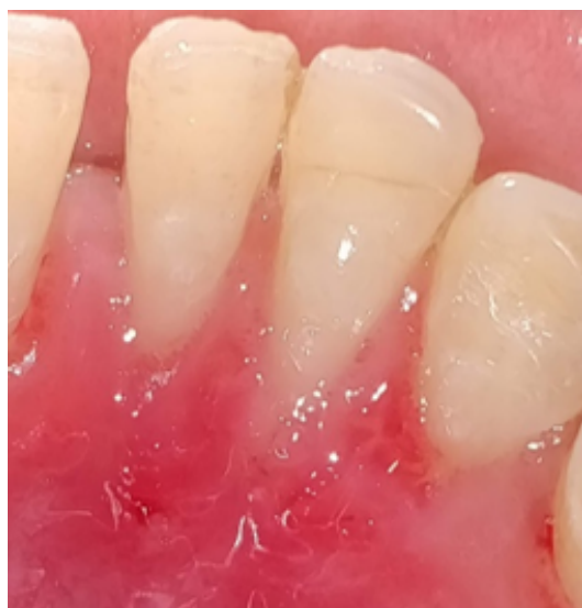
Fig. 7: Post-operative (21 days)