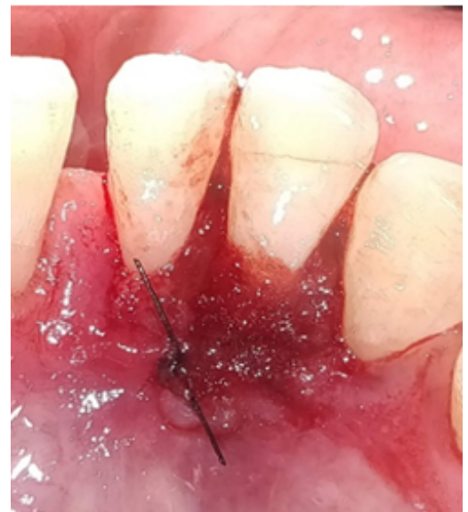
Fig. 6: Mucograft stabilized using sutures