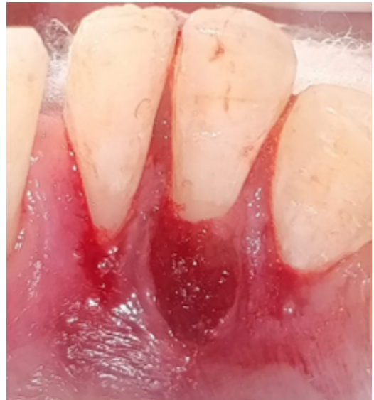
Fig. 5: Mucograft tunneled underneath papilla