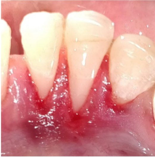
Fig. 1: Crevicular incision