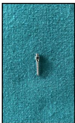
Figure 3: JJ Orthodontic implant