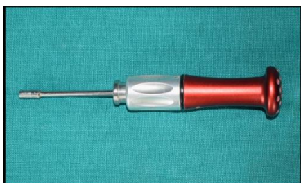
Figure 1: Implant driver

There was a statistically significant difference in pull-out strength observed at 60° and 90° angles ( P < 0.001 ) ( Table 3 ).