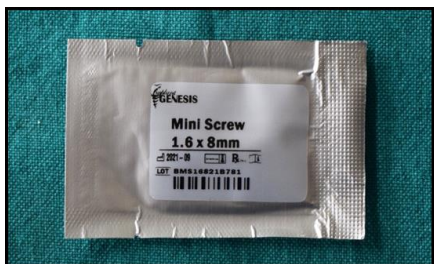
Figure 2: Packaging of JJ orthodontic implant