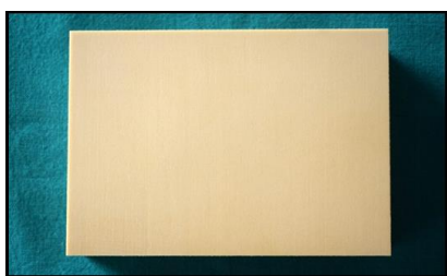
Figure 4: Sawbones polyurethane foam (artificial bone)