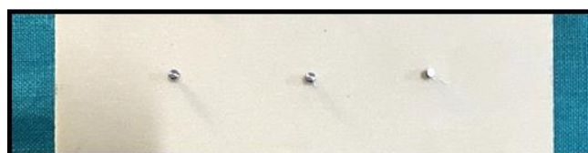
Figure 7: JJ Orthodontic implant places in 40 PCF artificial bone block at 90°