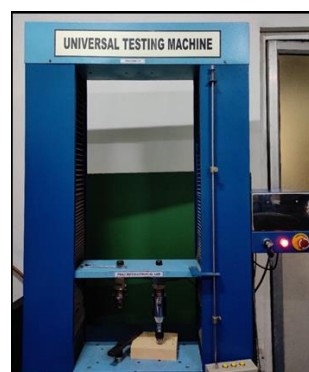
Figure 6: Universal testing machine